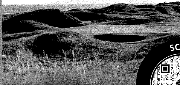
ROYAL TROON, SCOTLAND